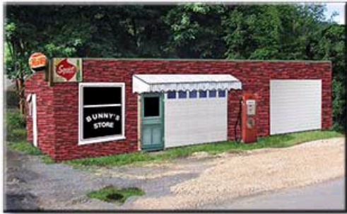
Photoshop 'renovated' Bunny's Store in Byrnesville.