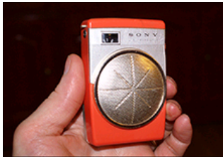
Grandad's Sony TR-620