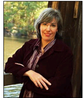
Maureen Hardegee AUTHOR

Current karma: 4.50 of 5, 2 vote(s) 300 hits