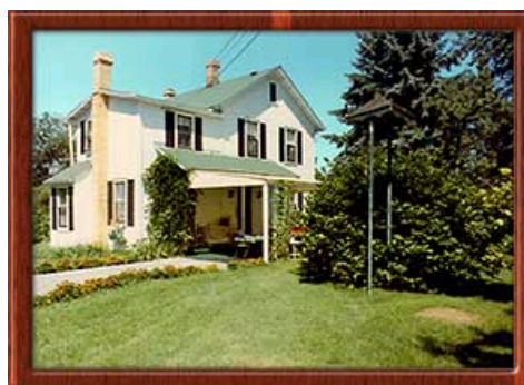
Schrot Homestead in Summer (side).