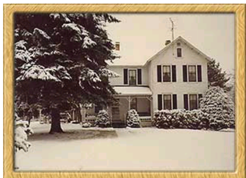
Schrot Homestead in Winter (front).

When I was young we used to visit the farm and homestead house where my grandmother was born in Clearfield, Pennsylvania. It was the Schrot homestead. It is a surrounding farm and a great old farm house which seems to have had more rooms built onto it through the years. Maybe this was the case as my grandmother had thirteen siblings.