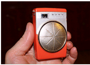
Grandad's Sony TR-620