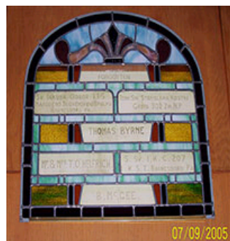
Stained Glass at Holy Cross